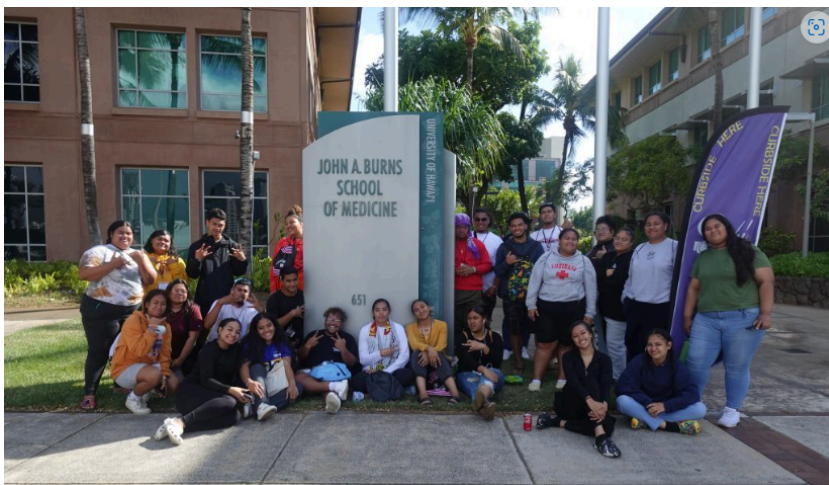
The inaugural cohort of the Pathway for the Advancement of Pacific Islanders (PAPI).