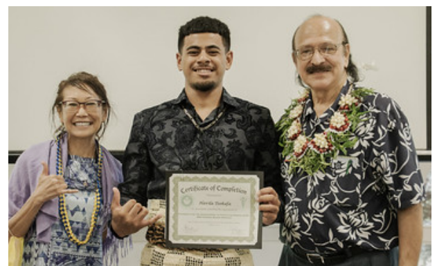
2023 PAPI Award recipient