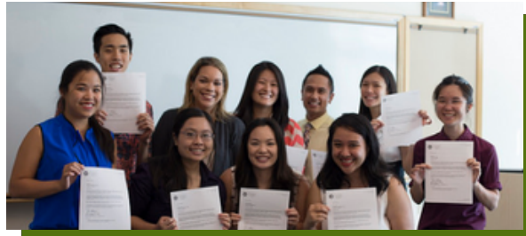
'Imi Ho'ōla Class of 2014-2015

most proud of becoming a mom to 2 little humans who have changed my life forever; it is absolutely possible to be both a mother and doctor! After completion of my chief residency year, I will be practicing primary care in a community serving a high population of Native Hawaiians."