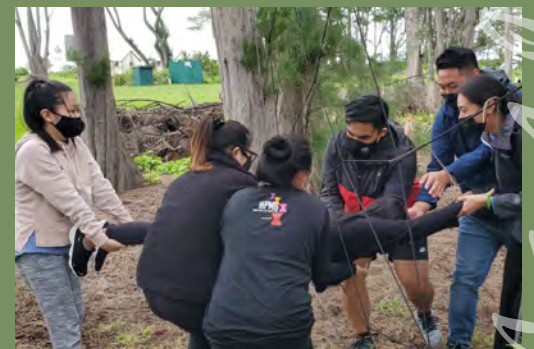
'Imi Ho'ōla Class of 2020-2021