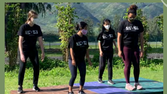
'Imi Ho'ōla Class of 2019-2020