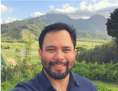
'Imi Class of 1997 JABSOM Class of 2001