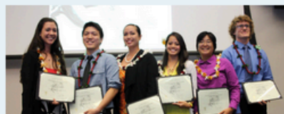
'Imi Class of 2013 (from left to right):

I am forever grateful to the 'Imi program for the opportunity to participate in the 'Imi program, to enter medical school, to be able to pursue my dream of being a Family Medicine physician in Hawai'i, and for the lifelong friends I made in the program. It is wild to think that in no time we will be finally joining the physician workforce in Hawai'i, carrying on the legacy of 'Imi, and encouraging patients interested in medicine to think about applying to the program!