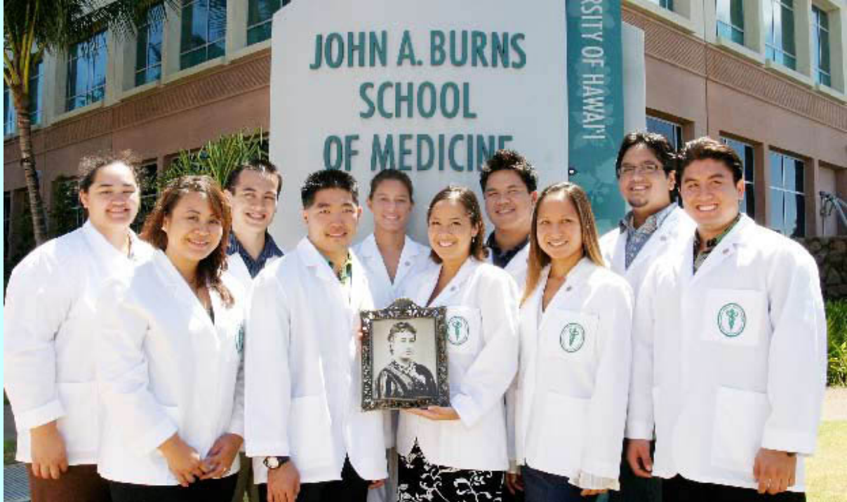
JABSOM's Kamehameha Schools graduates were featured on the cover of the December 2006 issue of "Imua", Kamehameha Schools' alumni magazine.

Of the 62 members of the freshman class at the University of Hawai'i medical school, 11 are graduates of Kamehameha Schools