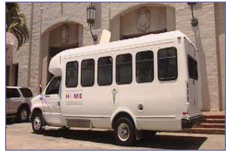
JABSOM'S mobile homeless clinic